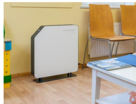
In the waiting room, one SteriWhite Air Q115 ensures clean air.